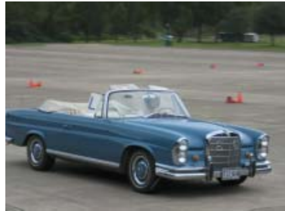
Most of all, good tire screeching fun!