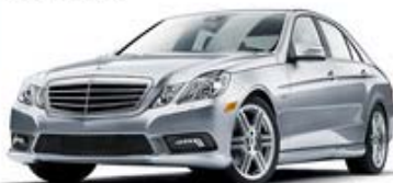
2010 Mercedes-Benz E-Class